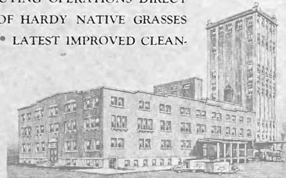
ASSEMBLING, CLEANING AND STORAGE PLANT ATCHISON, KANSAS

St. Louis—hub of trunk railroad lines to all parts of country. Served by numerous interstate truck lines. Low rates—quick service. Carlot, truckload or bag lot orders handled to your satisfaction